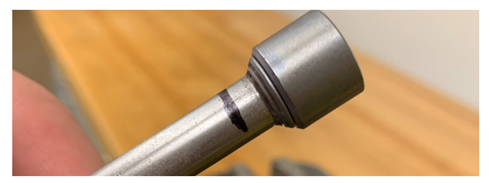
Loosen and back off nut to inspect the sleeve gap to ensure it has closed (see Figure 2).

The gap closure is an important visual inspection to make after presetting the FastSeal nut. A "closed gap" can vary from 0-0.01" (0-0.25mm). This small gap may be caused by spring back of the material and will close when the parts are tightened at final assembly.