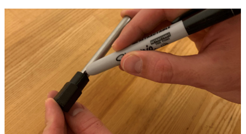
Step 1 – Place marking tool on tube until it bottoms out. Mark around OD as shown. If marking tool is not available, use insertion depths shown in Table 2.

FastSeal connections require pre-setting that can be accomplished by hand with a wrench and is best done with the assistance of a fixed vice.