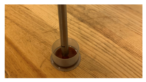
Step 3 – Lubricate the end of the tube with hydraulic oil to help with insertion in the next step.